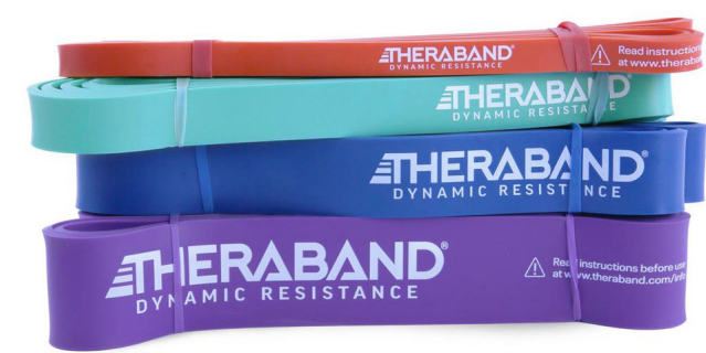
theraband crossfit loop power band